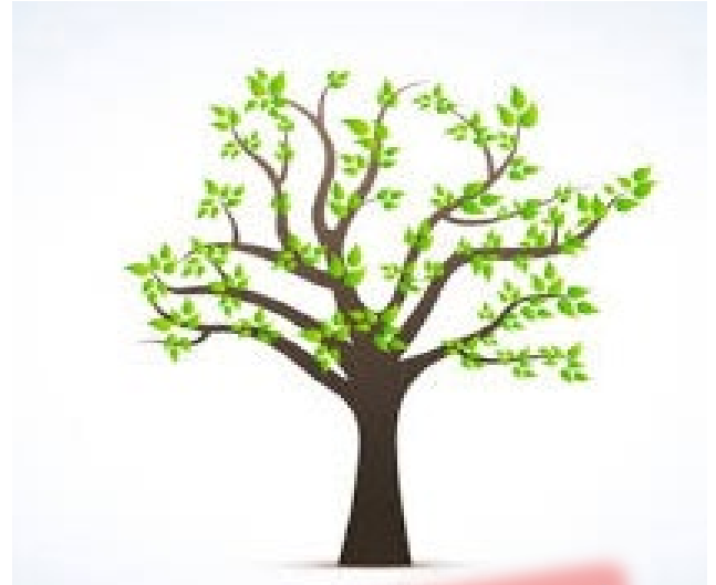
Tree of Knowledge of Good and Evil