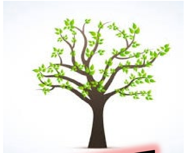
The Tree of Knowledge of Good and Evil